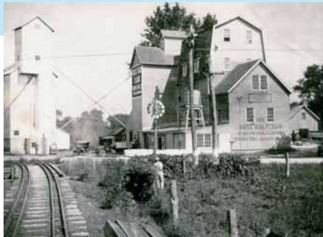
Radcliffe Mill was our last newsletter's Mystery Photo.

This dramatic mill complex on the edge of Chestertown toward Rock Hall features a mill constructed from 1840 to 1860, an annex built in 1900, a grain elevator dating to 1904, and a seedhouse constructed in 1947. Known also as Brooks Mill, the mill occupies a site along Radcliffe Creek known to have supported grain mills since 1694. Today, visitors can enjoy the art gallery in its main section and admire the soaring interior framing.