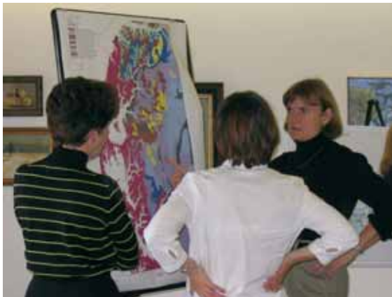
Work on the Heritage Plan involved many meetings!

Now on view at our web site, www.easternshoreheritage.org , the plan is a guide for the development of the Stories of the Chesapeake Heritage Area for the next ten years. It contains chapters on interpretation (the “stories”), heritage tourism, visitor orientation and such linkages as driving tours, heritage-based economic development through “target investment zones” (see map, page 2), and stewardship. An old-fashioned word implying taking care of resources, “stewardship” in this plan addresses historic and archeological preservation, the conservation of cultural traditions, and scenic protection.