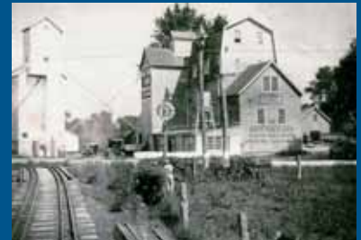
Chestertown’s Radcliffe Mill!